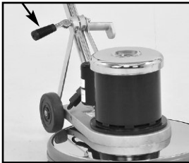
Easy to use handle height adjuster