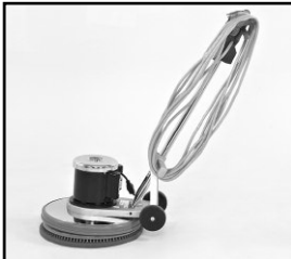
The 50 foot cord is non-marking safety yellow colored