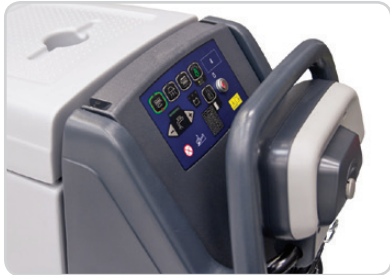
A wrap-around safe paddle system makes it easier to control and maneuver the machine.