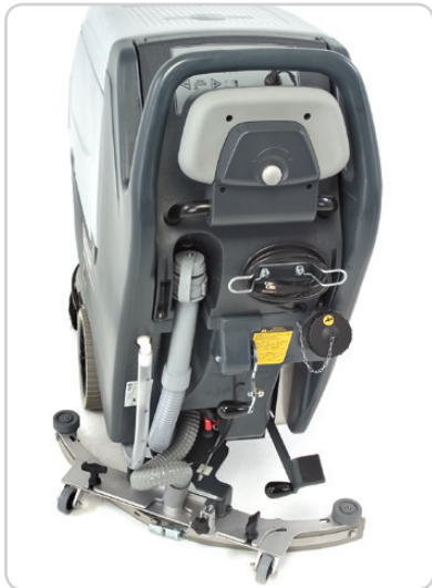
Easy access rear-port features include the solution tank fill, a large recovery drain hose with pinch-flow regulation, and the solution drain hose which also functions as a solution level indicator.