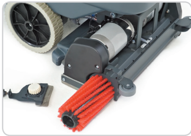
Tools-free removable brushes can be easily changed.