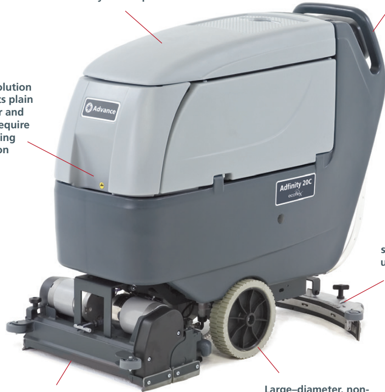
Center-pivot squeegee picks up 100% water on turns