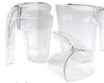
Nests for efficient storage.