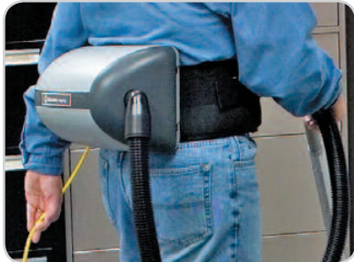
Padded belt is adjustable for operators comfort.