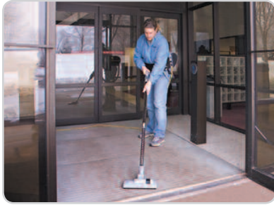
Combination floor tool is easy to use on hard or soft floors.