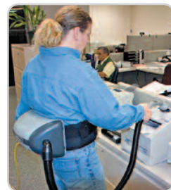
Detail cleaning on the go is easy with handy crevice tool and bristle brush.