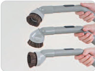
Rotating dust brush positions bristles for cleaning multiple surfaces.