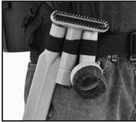
Accessory loops keep tools handy while operating.