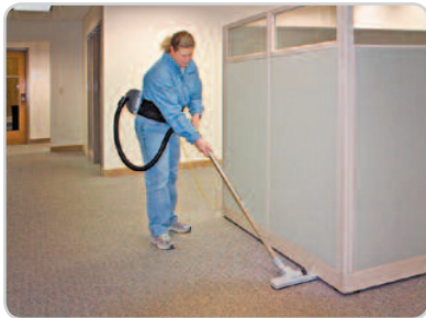
Edge cleaning is done easily with the Adgility™.