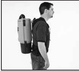
Adgility™ XP fits comfortably on the operator.