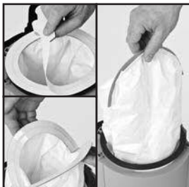
Full dust bag can be sealed before removal to contain all dirt.