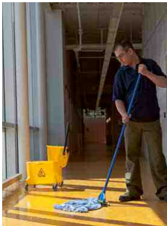
26 – 32 qt