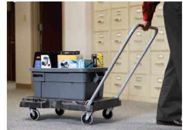
FG9S3000 / FG440000