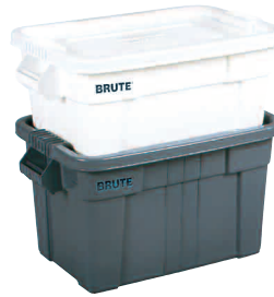
FG9S3000 / FG9S3100