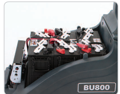
Choose between wet cell or service-free AGM batteries. Onboard charger is standard.