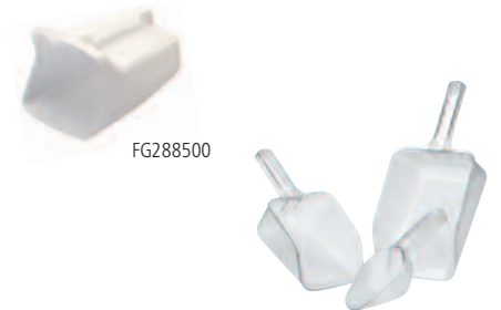
FG288400 / FG288200 / FG288600