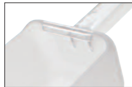
FG9F7500 and FG9F7600 feature hooks for use with Prosave® Ingredient Bins