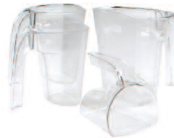
Nests for efficient storage.