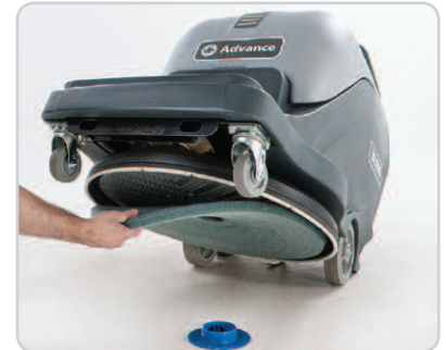
Pad changes are easier with the tip back design of the BU800™.