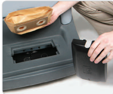
Two port dust bag is easy to access for bag changes.