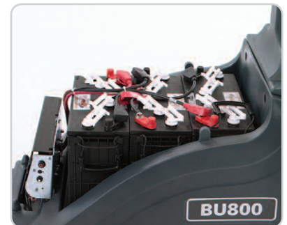
Choose between wet cell or service-free AGM batteries. Onboard charger is standard.