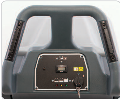
Easy to operate control panel and palm switches. Non-traction model shown.