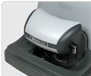
Optional vacuum available for active dust control.