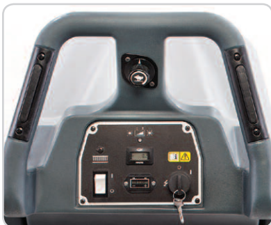
Traction drive model features speed control and reverse button.